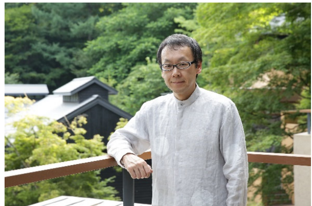
Hoshino Yoshiharu, CEO, Hoshino Resorts

The guests themselves likewise wish to avoid the “3Cs” inside the facilities. This is why we also developed a “visualization” service for how crowded the hot spring baths in the facilities are. You read a QR code with your smartphone, and it will indicate the degree of crowdedness classified into three levels. This is popular since you can check how crowded it is in advance, which eliminates the stress of having to come and go between the room and the bath.