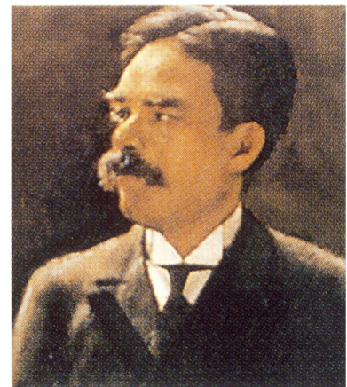
Uchimura Kanzo (1861-1930)

“Think of your employees as brothers. Treat your guests as family.”