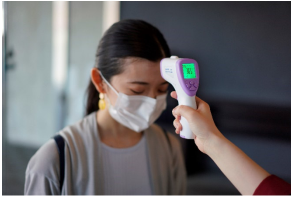
Check-in temperature measurement at Hoshino Resorts